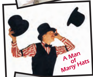
A Man of Many Hats