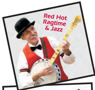
Red Hot Ragtime & Jazz