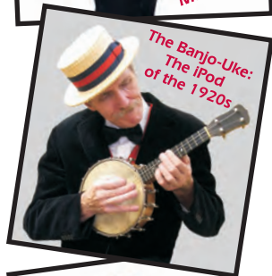
The Banjo-Uke: The iPod of the 1920s