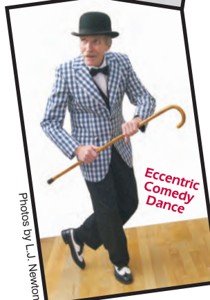
Eccentric Comedy Dance