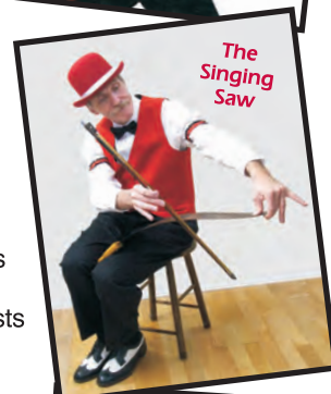
The Singing Saw