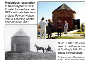
Meticulous restoration of Newburyport's 1822 Powder House has been NPT's ultimate hands-on project. Powder House Park & Learning Center opened in fall 2012.

Our city's defining historic ambience is at risk. In recent years, the city's attractiveness and prosperity – in part a product of the city's well-preserved architecture – has also drawn interest from those who are either (1) not yet informed about the economic, aesthetic, or cultural benefits of preservation, or (2) unwilling to consider how preservation might take its place alongside profit on the priority list. This puts the city's defining historic ambience at risk. Despite zoning laws and a demolition control ordinance, tear-downs and alterations by those who ignore city rulings or outspend opposition occur with increasing frequency, with replacement structures impacting the architectural integrity of our neighborhoods. When you join NPT, you'll be advocating for the preservation of our authentic historic ambience.