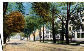
High Street, Newburyport, c. 1907 postcard view.

Why is preservation important? It is generally understood that historical resources – like buildings, landscapes, vistas, and iconic objects – in great part define a culture. In Newburyport, the concentration of authentic 18th- and 19th-century architecture – a rich mix of First Period through late-Victorian styles – helps residents and visitors alike grasp the city's unique sense of place. When you join NPT, you'll be advocating for the preservation of our unique sense of place.