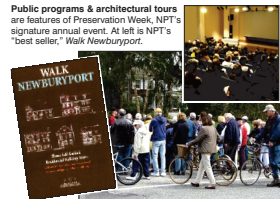
Public programs & architectural tours are features of Preservation Week, NPT's signature annual event. At left is NPT's "best seller," Walk Newburyport .

Linking the past with the present and future